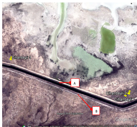
FIGURE 3. The location of Cihanbeyli. A. Road and B. Sewage Canal

A plant sample was collected from each station (root, stem and leaves in May; root, stem, leaves and flowers in June, July and August; root, stem, leaves, flowers, and fruits in September). As a result of the field studies, 30 fresh plant materials were obtained from both stations. Before the analysis, the plant material was purified from substances such as dust, soil and plant parts that could affect the analyses. Thirty soil samples from Eskil and Cihanbeyli plant collection stations were taken, placed in bags, labelled, and delivered to the laboratory for analyses. Each sample was 1.5 kg each and collected between 20 and 40 cm under the soil surface which is the level of plant roots.