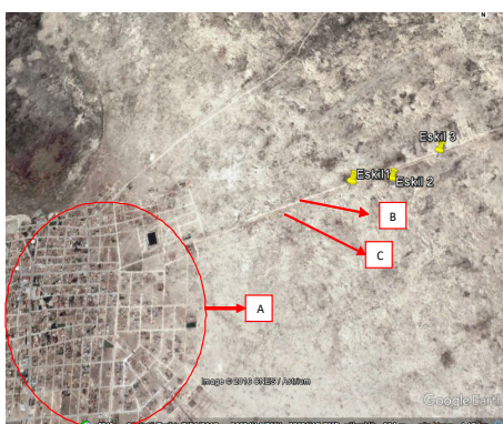
FIGURE 2. The location of Eskil. A. Eskil (Residential district), B. Road and C. Sewage Canal (approximate distance to the road 3-4 m)

The study areas included Eskil, Aksaray (Figure 2) and Cihanbeyli, Konya (Figure 3) which are the natural habitats of H. salsugineum . Field studies were conducted five times with regular intervals based on the vegetation period (flowering and fruiting) between May and September 2016.