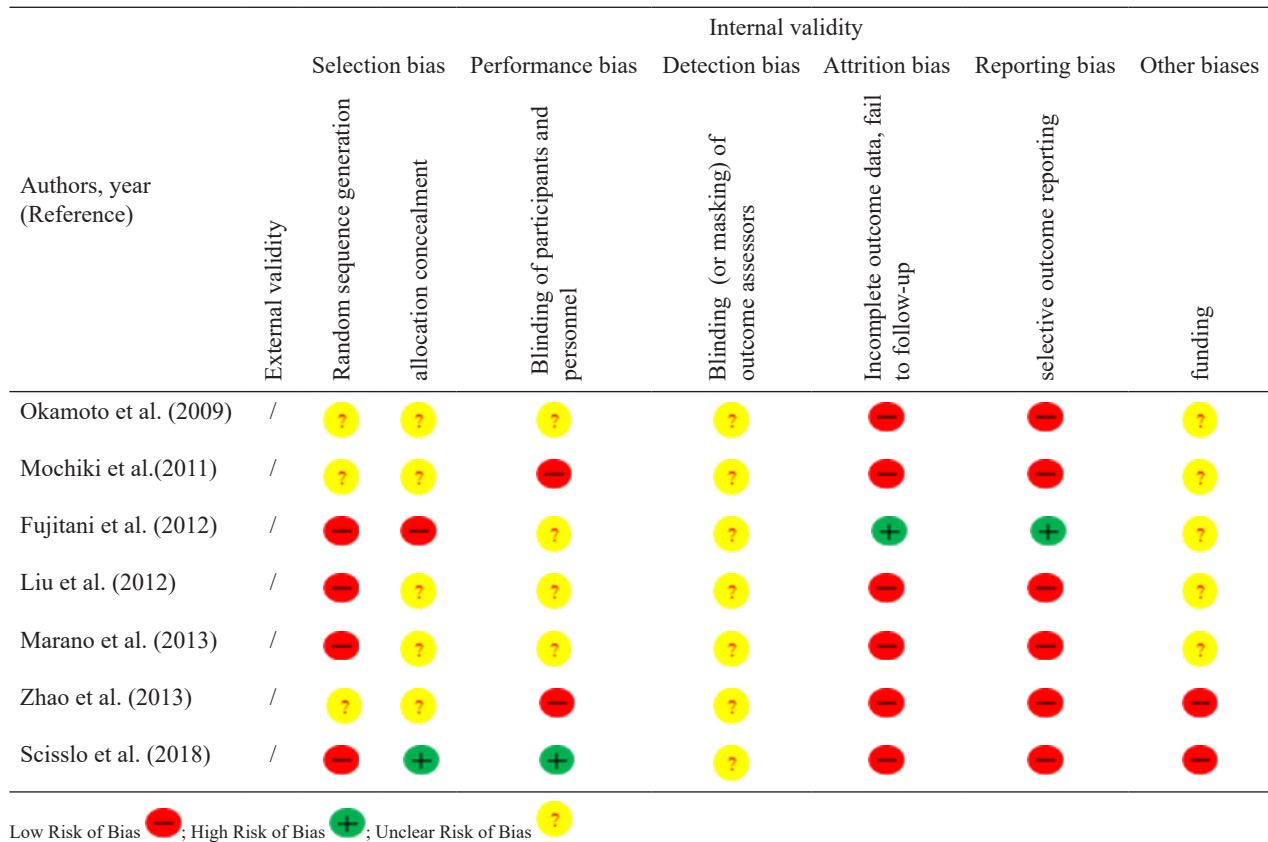
TABLE 2. Validity assessment including Risk of Bias Model for reviewed studies

standard EN supplemented with specific immune-promoting compounds, such as arginine, glutamine, omega-3 fatty acids and RNA. These compounds are responsible for strengthening immune defense and intestinal barriers, and modulating inflammatory responses (Chen et al. 2005). IN is recommended for patients undergoing abdominal surgery such as cancer and malnourished patients both pre-operatively and post-operatively.