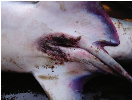
FIGURE 1. Cloaca of Alopias pelagicus showing parasite infestation

The parasites were found clustered around the cloacal aperture of the pelagic thresher shark and were of upstream orientation (Figure 1). Small wounds were found in the area when parasites were detached. Fifteen sharks were observed, out of which eight were found to be infested with parasites. The pre-caudal length (PCL) of the sharks ranged from 103 to 139 cm and weight from 30 to 55 kg. In total, 36 parasites were collected. All the collected parasite specimens were females of length range 10.8 to 16.7 mm total length (TL). Many parasites were lost before collection due to struggling of fish, handling of large fish, washing of deck to clear the deck from slime etc. The sharks were attended after clearing all the fishes mainly tunas and debris from the deck.