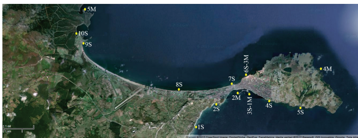
FIGURE 1. Map of sampling sites (S: Water; M: Mussel) 1S: DSI beach, 2S: Gelincik beach, 3S: Pier, 4S: Taşocağı, 5S: Karakum beach, 6S: The old market place, 7S: Outport, 8S: Bostancılı, 9S: Hotel beach, 10S: Akliman, 1M: Pier, 2M: Pier (boat stopping place), 3M: The old market place, 4M: Salesman, 5M: Hamsilos (Google Earth 2012)

In the study, water and mussels samples were analyzed for total bacteria, total coliforms, fecal coliforms and fecal streptococci. The mussel samples were aseptically opened with sterile lancet; samples were homogenized in a sterile blender and were diluted with sterile dilution water. Total bacteria count for the seawater and mussel samples were diluted at the rate of 10 -5 with sterile saline water. Then, the diluted samples were incubated to Plate Count Agar (Merck) by using pour plate technique in an incubator at a temperature of 37°C for 48 h. The plates were then checked for bacteria colony growth. The counting results were recorded as CFU/100 g or mL. The most probable method (MPN) was used for the enumeration of total and fecal coliforms in our study (AOAC 1998). Total and fecal coliforms were counted by the multiple-tube fermentation technique (triple serial dilution method). The results recorded according to table of MPN as CFU/100 g or mL. Besides, KF Streptococcus Agar (Merck) medium was used to isolate fecal streptococci and it allowed the optimal growth of all fecal streptococci strains at 24 h. In